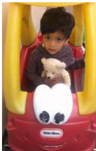
He spent some time out in the garden and was pleased when the